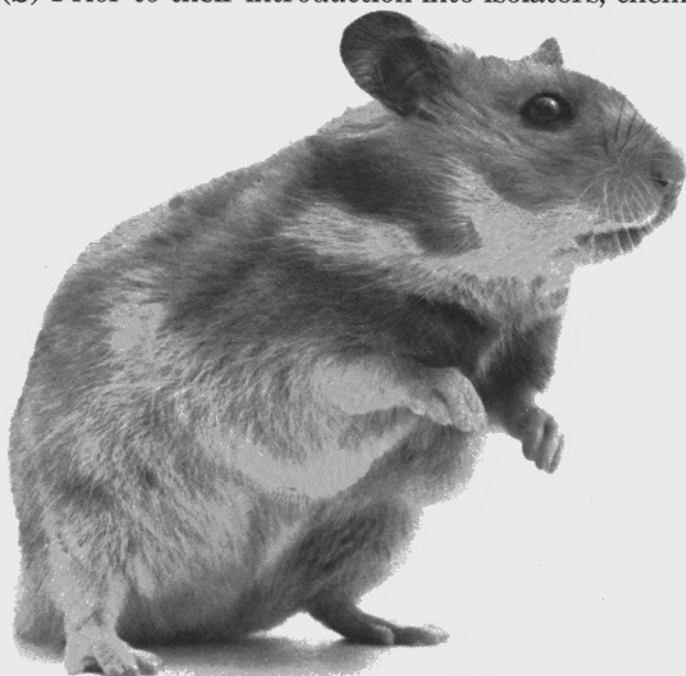
Mesocricetus auratus — hamster

We could go on. And we will with our possible dream of breeding a germfree hamster. Meanwhile, without question, our definition is improving. Contact us for more information, we'd like a word with you on the subject.